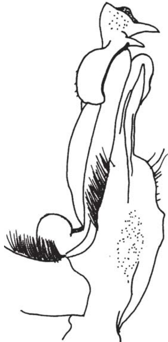
Figure 1 - Fredius reflexifrons (Ortmann, 1897), male, INPA 1318, first left gonopod, mesial view. Scale bar = 6 mm.

Remarks.- The easternmost records of this species are from the Rio Acará, in Tomé-Açu, state of Pará, and the Rio Gurupi, a coastal Atlantic river that divides the states of Pará and Maranhão (Magalhães, 1986). The latter was considered uncertain by Magalhães & Rodríguez (2002) because it is based on female specimens. The present records from the state of Ceará considerably extend the species distribution towards northeastern Brazil, clearly transcending the limits of the Amazon region.