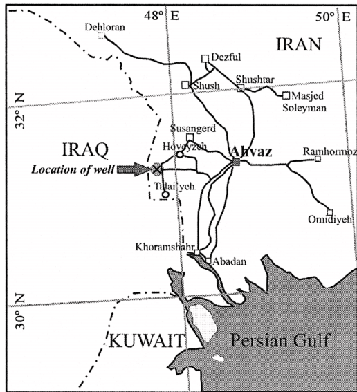
FIGURE 1—Map of southwestern Iran and adjacent countries, showing the well site (arrow) from which Tricarina gadvanensis n. gen. and sp. was collected.