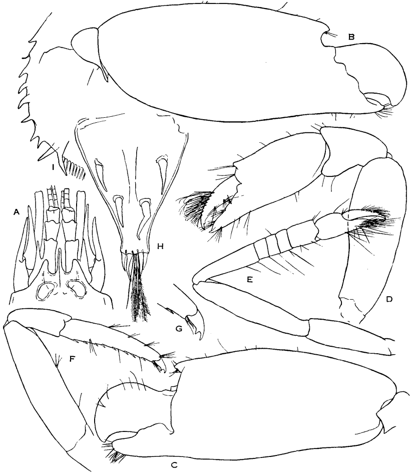
Fig. 1. Synalpheus osburni , new species.

setae of which the outer pair is the longer. The outer margin of the external branch of the uropods is armed above the transverse suture with ten teeth, of which the last two on the right outer blade and the penultimate tooth on the left one seem to have been broken off or injured.