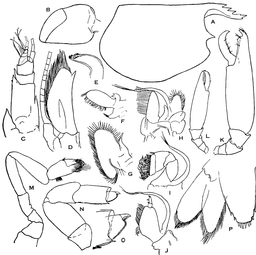
Fig. 3. Gnathophylloides mineri , new species.

and stout. They lack the relatively longer and characteristically bifid dactyls common to the known species of Gnathophyllum and Phyllognathia , or the less stout, simple dactyls of the described Hymenocera . The dactyls of the ambulatory legs of the genotype are unique within the family: short, stout, somewhat ovoid, armed with a stout terminal claw, immediately beneath which may be found a pair of slender spines, or