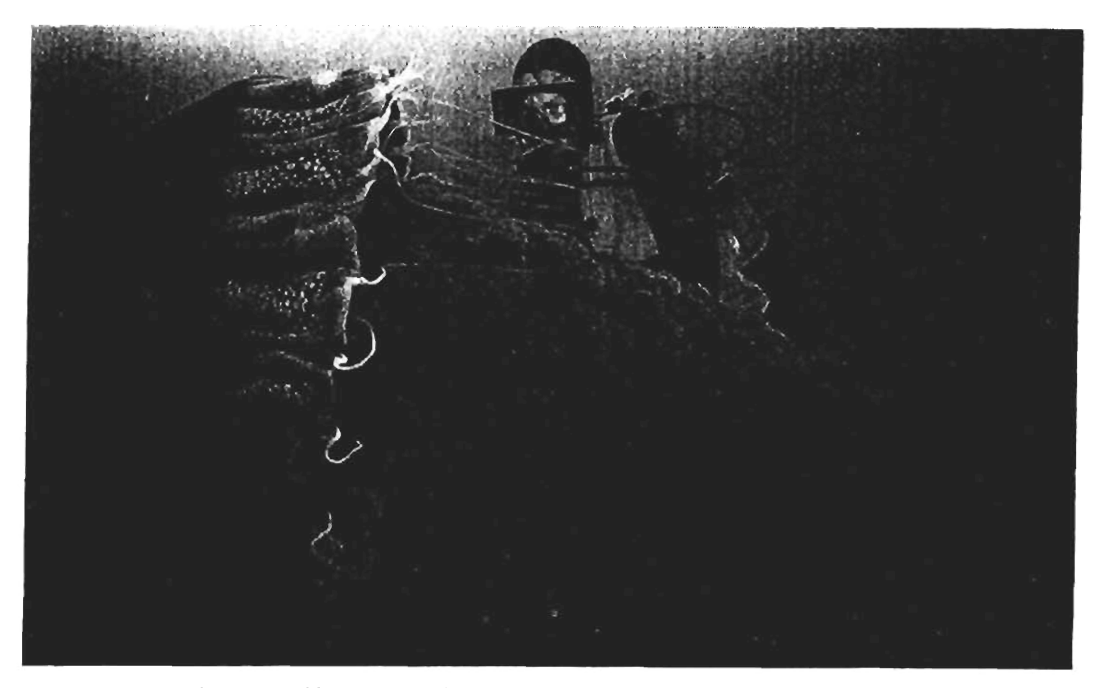
Figure 1. Chrysaora achlyos, new species, in situ photograph taken by members of Howard Hall Productions film crew off Coronado Norte, Islas de Los Coronados, northern Baja California, Mexico, July 1989. Side view of intact animal in front of diver; bell diameter estimated at 1 m. Note distinctive color pattern, length of tentacles, and especially length of combined oral arms (estimated to be 6 m), which trail to bottom right of photograph (terminating beyond frame of photograph). Used by permission of Howard Hall Productions.

zoan on the basis of nematocyst ultrastructure, allozyme electrophoresis, immunology, and morphology. Unfortunately, because of the paucity of specimens and their poor condition, a full description of this interesting animal by modern standards apparently is not possible. We describe it here primarily on the basis of gross morphology, color, and limited information on nematocyst types.