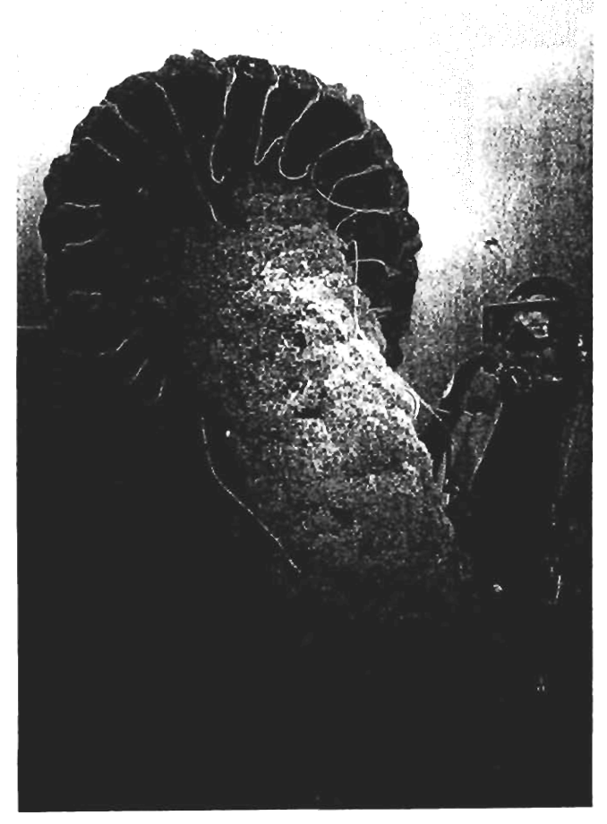
Figure 2. Chrysaora achlyos, new species, ventral view of different specimen photographed on same day and in same location as in Figure 1, with diver inspecting oral arms and underside of bell. Note number and arrangement of tentacles and spiraling and interlocking of oral arms.

1-3, table 1.—Anderson, 1992: 26 (four photographs by H. Hall).—Campbell, 1992: 2, 16, and inside front cover (all photographs by H. Hall).