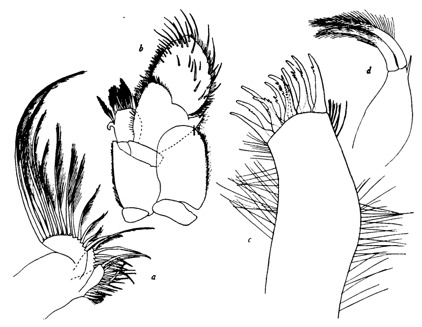
Fig. 1.—Synidotea macginitiei, new species. a, right second maxilla. b, left maxilliped; c, left first maxilla, outer lobe. d, left first maxilla, inner lobe.

front produced on either side of a median excavation in a narrow border, the lateral portions of which form an angle with the dorsal portion as in S. bicuspida. Eyes not visible in a ventral view, small, round, and situated on either side some distance from lateral margin which is expanded to form a narrow border. First and second articles of first antenna about equal in length; third, one and one-half times length of second; fourth a little shorter than third. First pair of antennae extend to middle of fourth peduncular joint of second pair. Basal and second articles of second antenna about equal in length, basal article not visible in dorsal view; third and fourth each about twice as long as second; fifth nearly as long as third and fourth together. Flagellum consists of fifteen articles, terminal one tipped with a tuft of hairs. Second antenna extends to posterior margin of third thoracic segment. Ventral side of left outer lobe of first maxilla consists of eleven tooth-like spines, many of them denticulate, and one long tapering spine. Some of the long plumose hairs of outer lobe of second maxilla extend to second joint of second antenna. (See Fig. 1.)