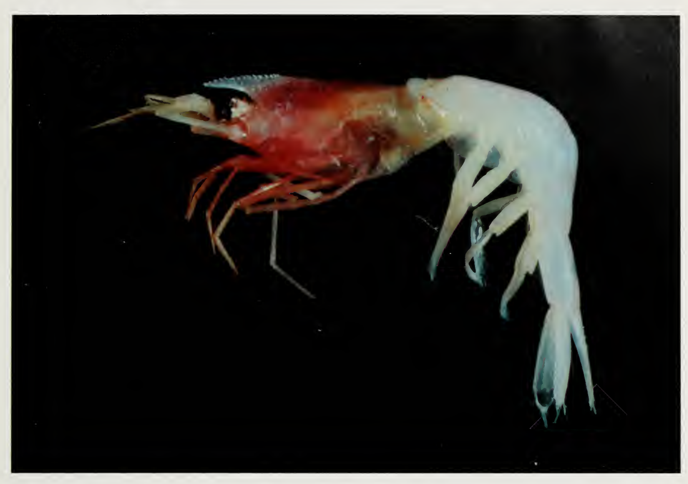
Fig. 3. Bitias brevis (Rathbun, 1906), Taiwan, TAIWAN 2000 stn CP 55, female 7.2 mm cl, NTOU 2000-55.

armed only with 2–4 lateral, and 0 or 1 ventral spines; carpus with 2 ventral spinules.