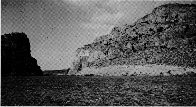
Figure 3. Currant Creek Gap, Nevada. Westward view. Lighter colored exposure at the base, on the right side of photograph is where Sonoraspis californica was found.

the northside of U.S. Highway 6, in thin-bedded, platy, gray limestone, 300 feet north and 400 feet west of the southeast corner of Sec. 24, T. 11 N., R. 58 E., Currant Mountain quadrangle (U.S.G.S., 1957 ed.), Currant Creek, Nye County, Nevada (Figs. 3 and 4).