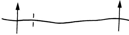
Fig. 6. Septal suture of the Rose Canyon sepiamorph sepiid, hypotype, LACMIP 8407, at chamber height of 15 mm along left-lateral side of phragmocone, \times 2.8 . The septal suture was drawn from photographs.

ventral lobe. Belosepia normally has a well developed ventral lobe (Jeletzky 1969, p. 26). The Rose Canyon sepiid is at least specifically distinct and possibly generically distinct, but it is doubtful that one should erect any new taxa for the Rose Canyon specimen because of the fragmentary and otherwise poor preservation.