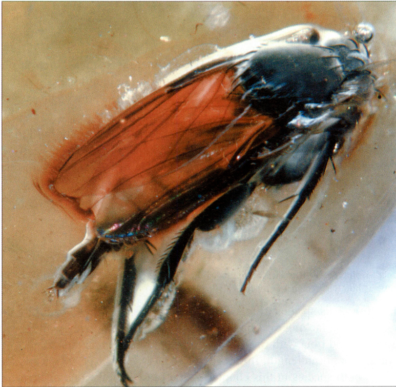
Fig. 1: Hypocera oschini spec. nov. Holotype female.

The new species possesses a combination of character states whose explanation potentially differs from that given by BROWN & BUCK (1998). Examining each of the synapomorphies