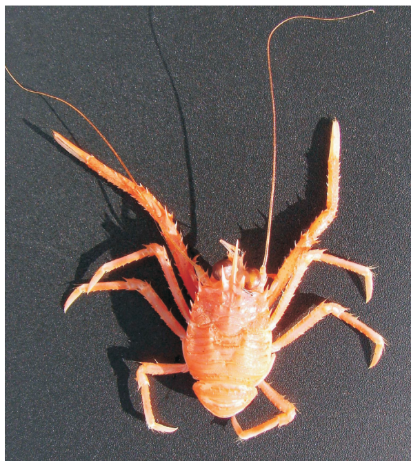
Fig. 1. Munida bapensis Hendrickx, 2000. Male, dorsal view (EMU-8277).

Munida bapensis Hendrickx, 2000: 165-168, fig. 3.