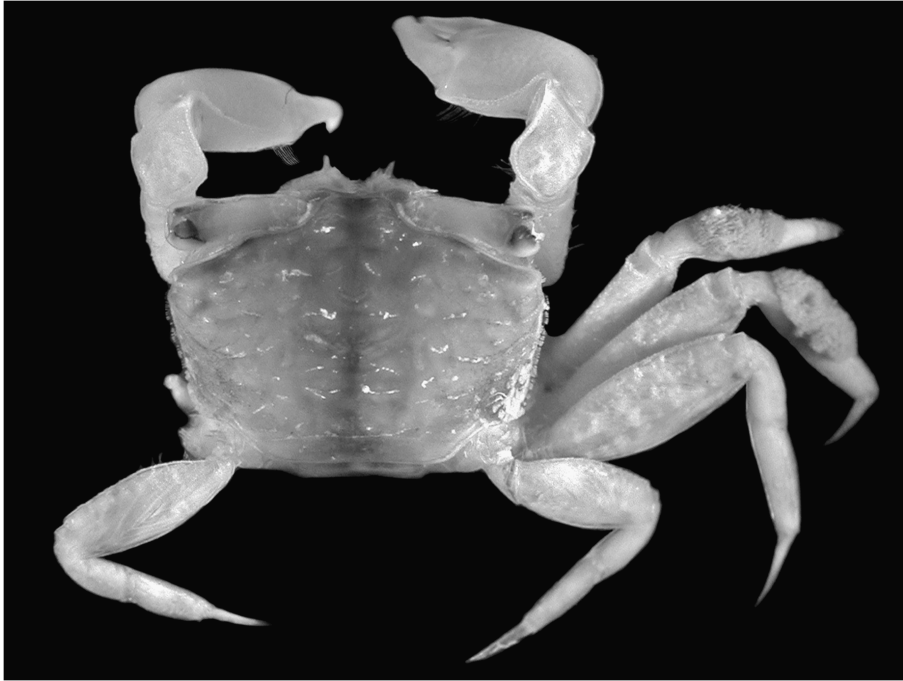
Fig. 1. Ilyoplax danielae sp. nov., holotype male (5.4 × 3.9 mm), Panglao I., Bohol Province, Philippines (NMCR).

Third maxillipeds (fig. 2B) with merus longer than ischium (approx. 1.3×); antero-internal angle of ischium broadly triangular; produced along edge of merus; ischium with oblique distolateral line of microscopic granules equipped with long plumose setae, longest near outer margin. Maxillipeds moderately bulging; completely closing buccal cavity.