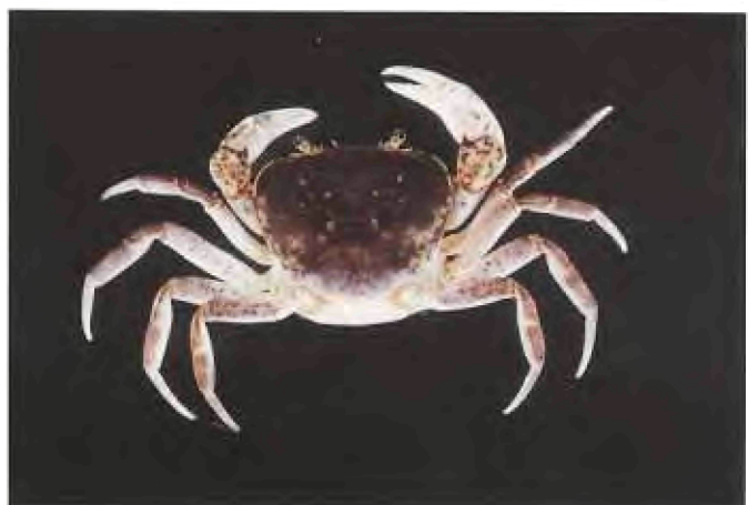
Fig. 1. A living individual and colour patterns of Geothelphusa miyakoensis , new species. Upper left, living individual; upper right, male with purplish brown colour; lower left, male with brown background and a white region on the posterolateral margin; lower right, female with purplish brown colour.