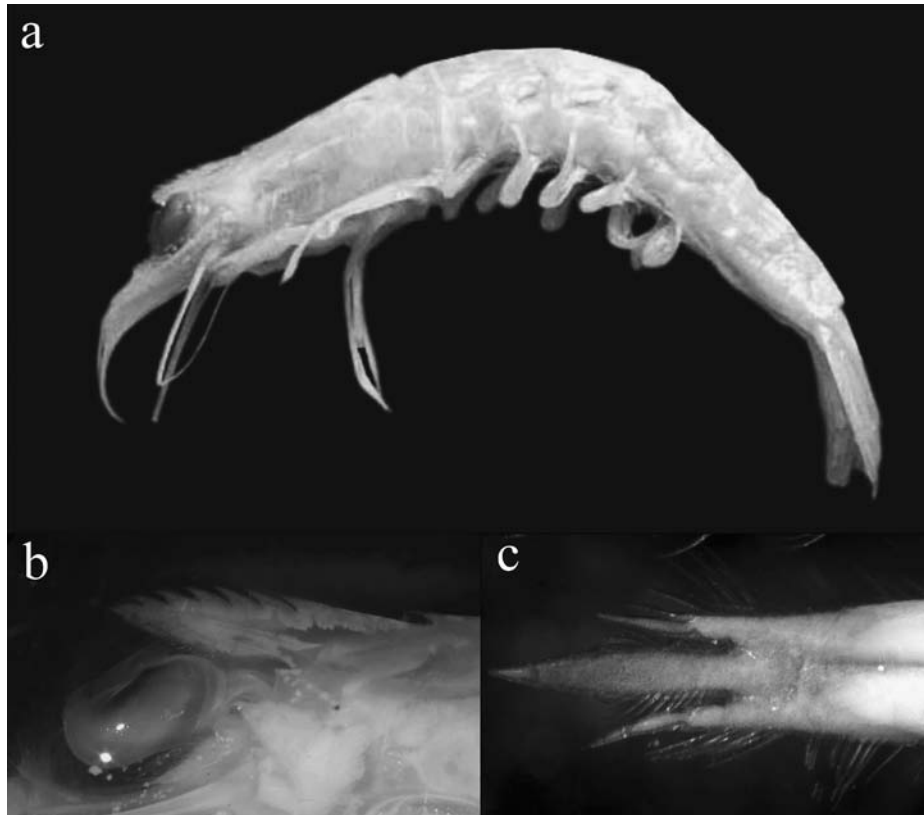
Fig. 1. Trachypenaeopsis mobilispinis (Rathbun, 1915), from Pará, Brazil: a, female, carapace length, 11.8 mm, lateral view; b, detail of rostrum; c, detail of tip of telson.

in Bermuda, Bay of Campeche (Cuba), and Cay Sal Bank (Bahamas). Huff & Cobb (1979) based upon a single male specimen, extended the known distribution to Jupiter Inlet, on the Florida east coast. Finally, Campos & Côrtes (1994) obtained 66 specimens from collections made in the Santa Marta region (Colombia) and between the mouth of the Río Magdalena and Santa Marta (Colombia), trawled at less than 10 and 30 m, respectively, and extending the reported bathymetric range of this species, previously known only from shallow waters. The collection sites in Colombia are under the influence of river discharge.