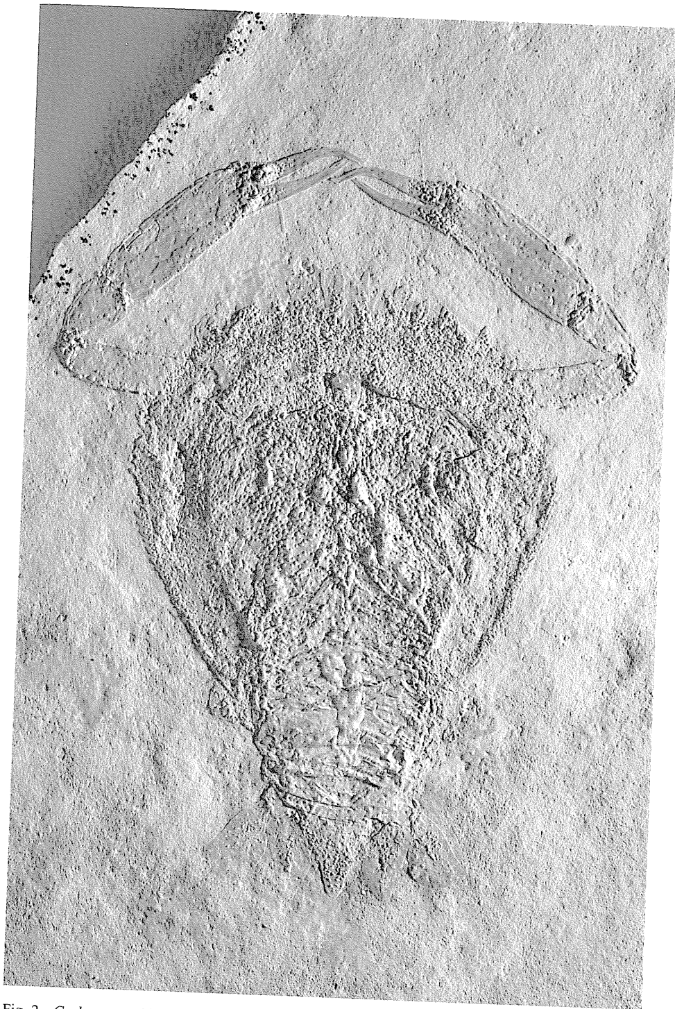
Fig. 2 - Cycleryon wulfi n. sp., holotype, n. cat. JME SOS 4932 (Wulf's collection, n. 9705) (x 2). Fig. 2 - Cycleryon wulfi n. sp., olotipo, n. cat. JME SOS 4932 (collezione Wulf, n. 9705) (x 2).