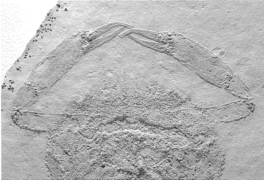
Fig. 3 - Cycleryon wulfi n. sp., serrate frontal margin (margine frontale dentato) (x 2).