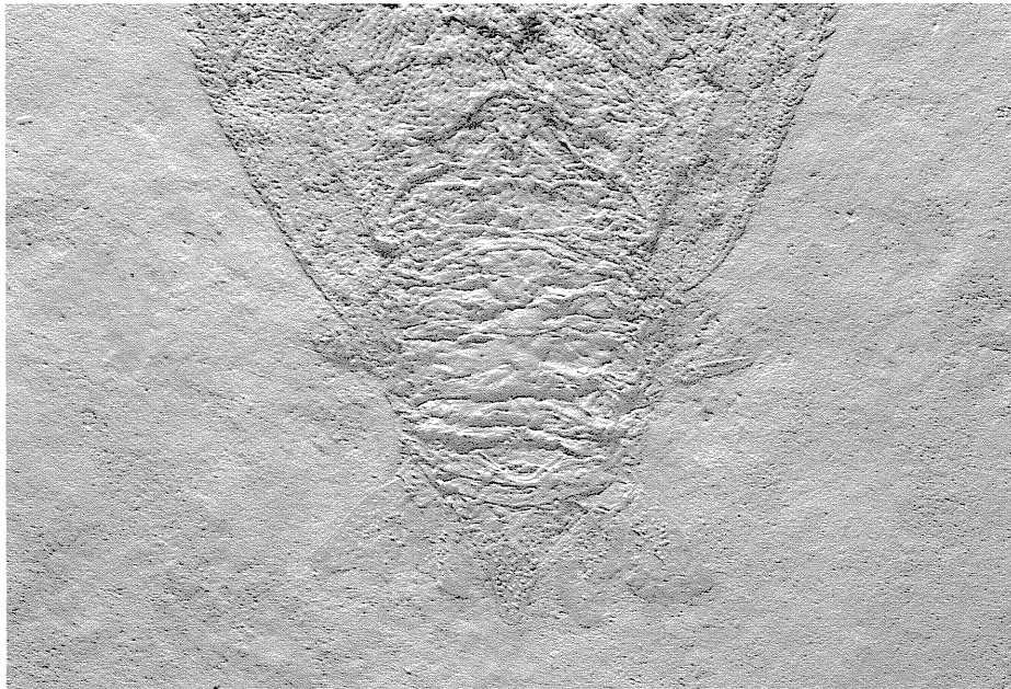
Fig. 4 - Cycleryon wulfi n. sp., abdomen (addome) (x 2).