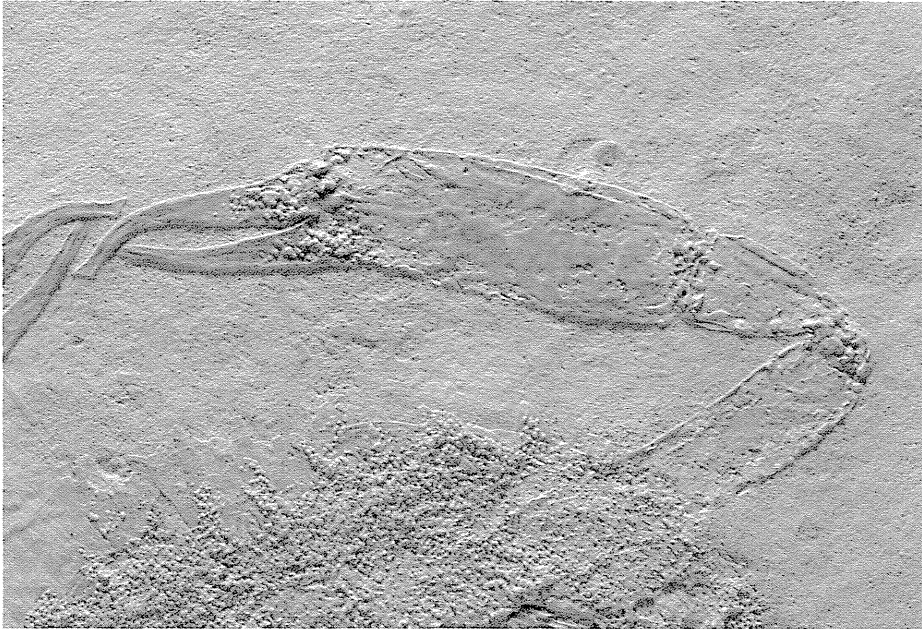
Fig. 5 - Cycleryon wulfi n. sp., pereiopod I (pereiopode I) (x 2).