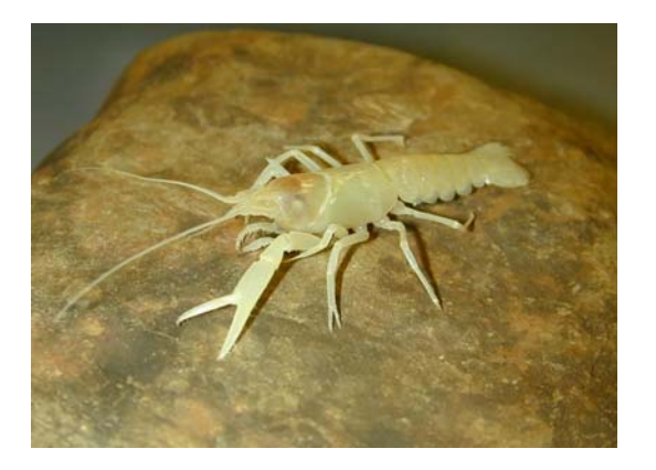
Fig. 1 Orconectes incomptus (Hobbs & Barr 1972), a cave adapted freshwater crayfish from the Cumberland Plateau escarpment in northern Tennessee, USA

crayfish typically has a life span of about 2 years (although some surface and cave species can live beyond 20 years). They reproduce sexually, although hermaphroditic specimens and even parthenogenetic specimens are known to occur (Scholtz et al. 2003). Freshwater crayfishes are omnivorous and typically nocturnal. They are voracious eaters and can be extremely destructive when introduced to non-native habitats. A few freshwater crayfish are particularly invasive (e.g., Orconectes rusticus) and/or were distributed in the aquaculture trade (e.g., Procambarus clarkii). These introduced species wreak havoc on natural ecosystems to which they are not native, but the vast majority of freshwater crayfishes are extremely narrowly distributed and hence are endangered due mainly to the destruction of the freshwater ecosystems in general. In this article, we review the freshwater crayfish diversity as it is currently understood and emphasize both the phylogenetic diversity and conservation status of this interesting group of freshwater crustaceans.