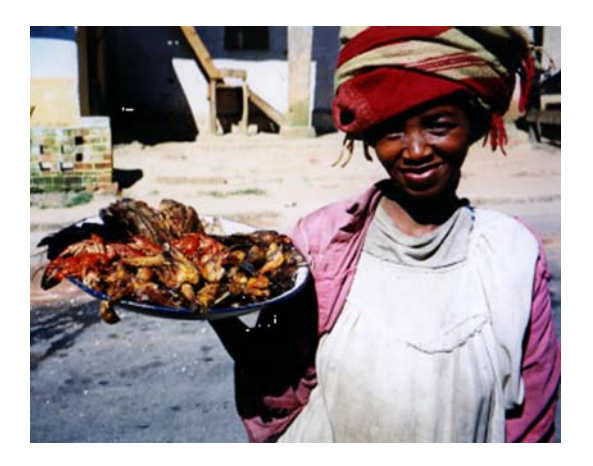
Fig. 4 Crayfish are staple in many cultures both as a food source and source of income; this example is from a roadside crayfish stand in Madagascar with both Astacoides madagascarensis and Astacoides betsiloensis for sale

Freshwater cravfish are a much sought after food item in many cultures (Fig. 4) and a significant aquacultural commodity. Unfortunately for many of the charismatic species (e.g., the Tasmanian Giant Lobster, Astacopsis gouldi), over-harvesting coupled with degradation of habitat has resulted in the endangerment of many crayfish species (e.g., Horwitz 1994). Other areas, such as Madagascar, support a sustainable harvest of crayfish, yet these populations are typically imperiled by stream degradation (Jones et al. 2005). While all 640+ species of freshwater crayfish have yet to be categorized for conservation status relative to the IUCN Red List Criteria (IUCN 2001), a large number of species already occur on that list. Taylor et al. (1996) found that over 50% of the United States species of freshwater crayfish are endangered or threatened to some degree. Yet, surprising, very few of these species are under national protection with a few more under local (state, provincial) protection. For example, in the United States, 20 species are known from less than five localities (with 15 known only from a single locality) and well over 210 species are considered endangered or threatened, but only four species are listed by the federal government on the Endangered Species List. Native crayfish play an essential role in their native habitat and may act as keystone species for the freshwater ecosystems where they occur. Yet