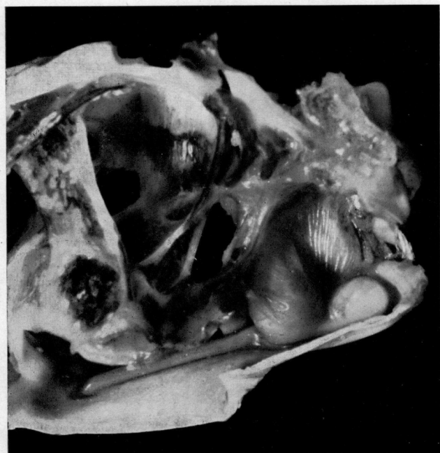
FIG. B. \times 3 .