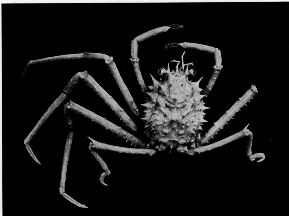
FIG. A. \times 2/3 .