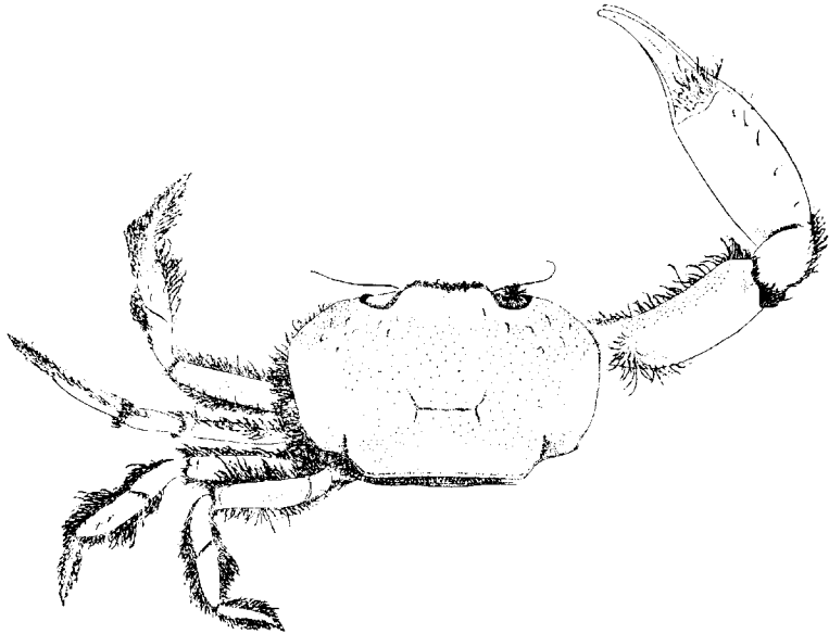
Fig. 3. Libystes villosus Rathbun, ♀ (No. 11049).

The anterolateral border is thin and entire; the border itself and the dorsal surface inner and along the border are minutely and thickly granulated; the anterolateral and posterolateral borders are not distinctly delimited, but in reality the latter is considerably longer and very slightly inclined.