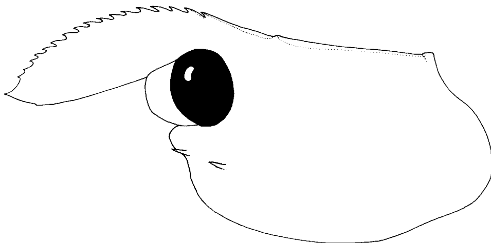
Fig. 1. Periclimenes imperator Bruce, 1967, male specimen RMNH D 47515, pool. 1.47 mm, lateral aspect of carapace.

Taxonomy.— The distinction between P. imperator and P. rex Kemp has been discussed by Bruce, 1967. Except for the holotype specimen described by Kemp (1922) from the Andaman Islands, records of P. rex have been assigned to P. imperator (see below) or Periclimenes soror Nobili, 1904 (MacNae & Kalk, 1958: 75; 1962: 111, 118).