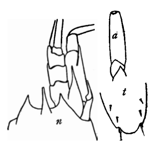
FIG. 2.—SYNALPHEUS TOWNSENDI SCAPHOCERIS. a. CARPOCERITE. n. ANTERIOR REGION. t. TELSON.