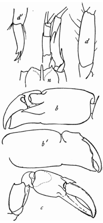
FIG. 1.—ALPHEUS CANDEL. b. INFERO-EX-TERNAL SURFACE OF LARGE CHELA. b'. SUPERO-INTERNAL SURFACE OF LARGE CHELA. C. SMALL CHELA. d. MERO-PODITE OF THIRD FOOT. d'. DACTYL OF FIFTH FOOT. n. ANTERIOR REGION.

Guérin's type was from Cuba. The figure and description which he gives, although insufficient, apply to the specimens from Tortugas with singular accuracy. The form of the frontal border, sinuous between the spinous orbital arches and the rostrum, the proportion of the articles of the antennule, the stylocerite, the spine of the basicerite, the relative proportions of the two pairs of antennæ, of the carpocerite and of the scaphocerite; all these details agree with