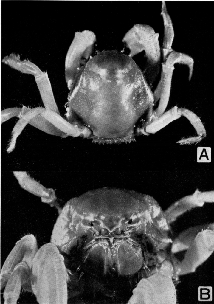
Fig. 2. Mictyris livingstonei McNEILL.

regions of both sides being widely apart. The branchial regions are only moderately swollen, and sparsely covered with short granular ridges which are rugose and rather of scaly appearance. The posterior border of the carapace is nearly straight, as wide as the space between the anterolateral spines of both sides, not produced into a thin plate, both lateral ends being angulated. The front with the short and concave lateral borders agrees with one of the paratypes illustrated by the original author, being fairly pointed at the apex. The eyes are remarkably small. This feature is one of the characteristics of this species, and as the original author noted, may have been derived from the hiding habits without congregation on the surface of the exposed flats. The