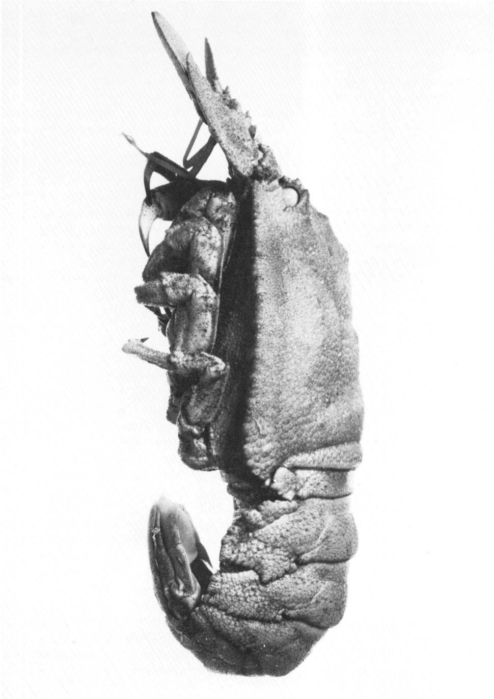
Fig. 2. Scyllarides obtusus spec. nov., paratype male in lateral view. Saint Helena, 1909, J.T. Cunningham (B.M.).