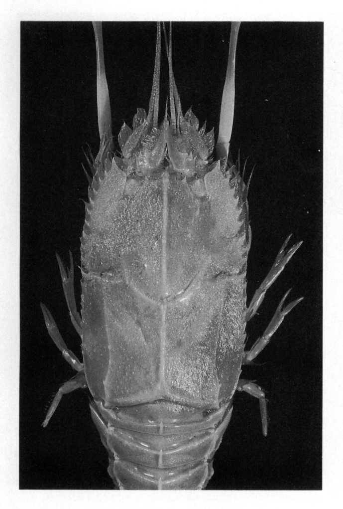
Fig. 10. Stereomastis phosphorus (Alcock), female, cl. 42.5 mm, AM P20664, carapace.

28°01'S 154°00'E, 548 m, 17 August 1978, FRV Kapala, stn K78-17-10; 1 female, cl. 49 mm, 1 male, cl. 42 mm, AM P44915, north-east of Point Danger, 28°03'S 154°04'E to 28°01'S 154°04'E, 732 m, 6 November 1978, FRV Kapala, stn K78-23-08; 1 female, cl. 54 mm, 1 ovigerous female, cl. 56 mm, AM P44913, east of Minnie Water, 29°45'S 153°45'E to 29°42'S 153°46'E, 505 m, 19 April 1978, FRV Kapala, stn K78-05-06; 1 female, cl. 49.5 mm, AM P39732, northeast of Wooli, 29°50'S 153°43'E to 29°48'S 153°44'E, 503 m, 25 April 1978, FRV Kapala, stn K78-06-02; 1 ovigerous female, cl. 70 mm, AM P21687, north-east of Wooli, 29°52'S 153°43'E to 29°46'S 153°45'E, 505 m, 10 October 1975, FRV Kapala, stn K75-09-03; 2 males, cl. 28.5 and 36.5 mm, AM P26554, north-east of Wooli, 29°53'S 153°42'E, 485 m, 23 August 1977, FRV Kapala, stn K77-13-12; 1 female, cl. 44.5 mm, 3 males, cl. 28.5, 34.5 and 38.5 mm, 2 juveniles, cl. 17 and 25 mm, AM P26804, south-east of Newcastle, 33°08'S 152°27'E to 33°10'S 152°24'E, 594 m, 7 December 1977, FRV Kapala, stn K77-23-09; 3 males, cl. 20, 29 and 35.5 mm, AM P26757, south-east of Newcastle, 33°11'S 152°24'E to 33°09'S 152°25'E, 732 m, 7 December 1977, FRV Kapala, stn K77-23-10; 1 male, cl. 31 mm, AM P44918, east of Budgewoi, 33°11'S 152°25'E, 722-768 m, 12 April 1989, FRV Kapala, stn K89-06-05; 1 female, cl. 30 mm, AM P20661, north-east of Broken Bay, 33°30'S 152°05'E to 33°26'S