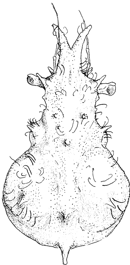
Fig. 3. Aepinus indicus (Alcock). Male, c.l. 10.5 mm, SW of Point Cloates (WAM 282-67), carapace dorsal aspect.

Remarks. These specimens agree with the original description and figures given by Alcock in arrangement of spines on the carapace, presence of knobs on the tips of the spines including the rostrum, form of the rostrum, orbit