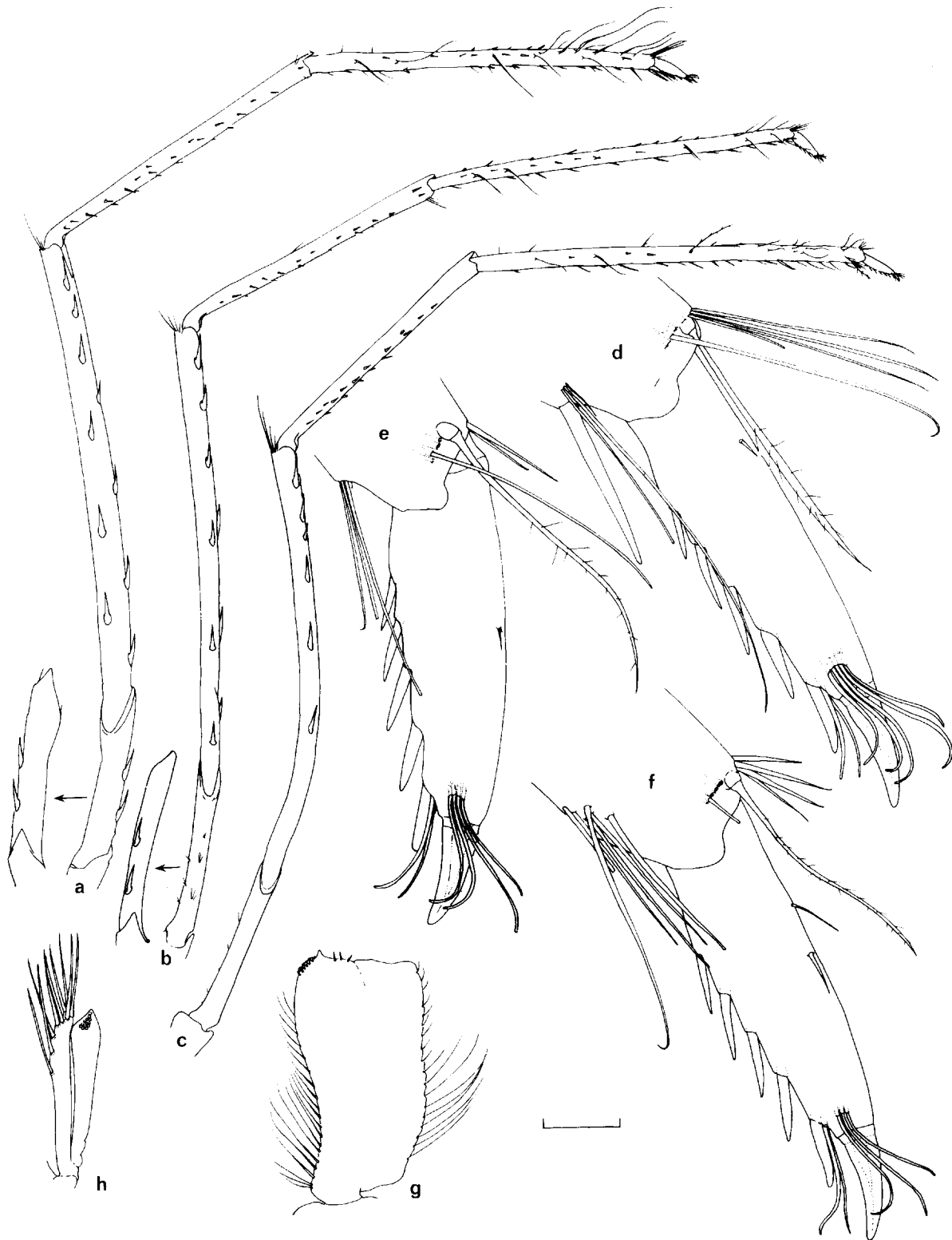
Fig. 3. Bitias stocki new species, RMNH D 39051 (male holotype, carapace length 7.9 mm). a, right third pereiopod, outer lateral aspect, - inner lateral aspect ischium; b, right fourth pereiopod, outer lateral aspect, - inner lateral aspect ischium; c, right fifth pereiopod, outer lateral aspect; d, dactylus right third pereiopod, outer lateral aspect; e, dactylus right fourth pereiopod, outer lateral aspect; f, dactylus right fifth pereiopod, outer lateral aspect; g, right endopod of first pleopod; h, right appendix interna and appendix masculina. (Scale: a-c = 2.5 mm; d-f = 0.25 mm; g, h = 0.1 mm).