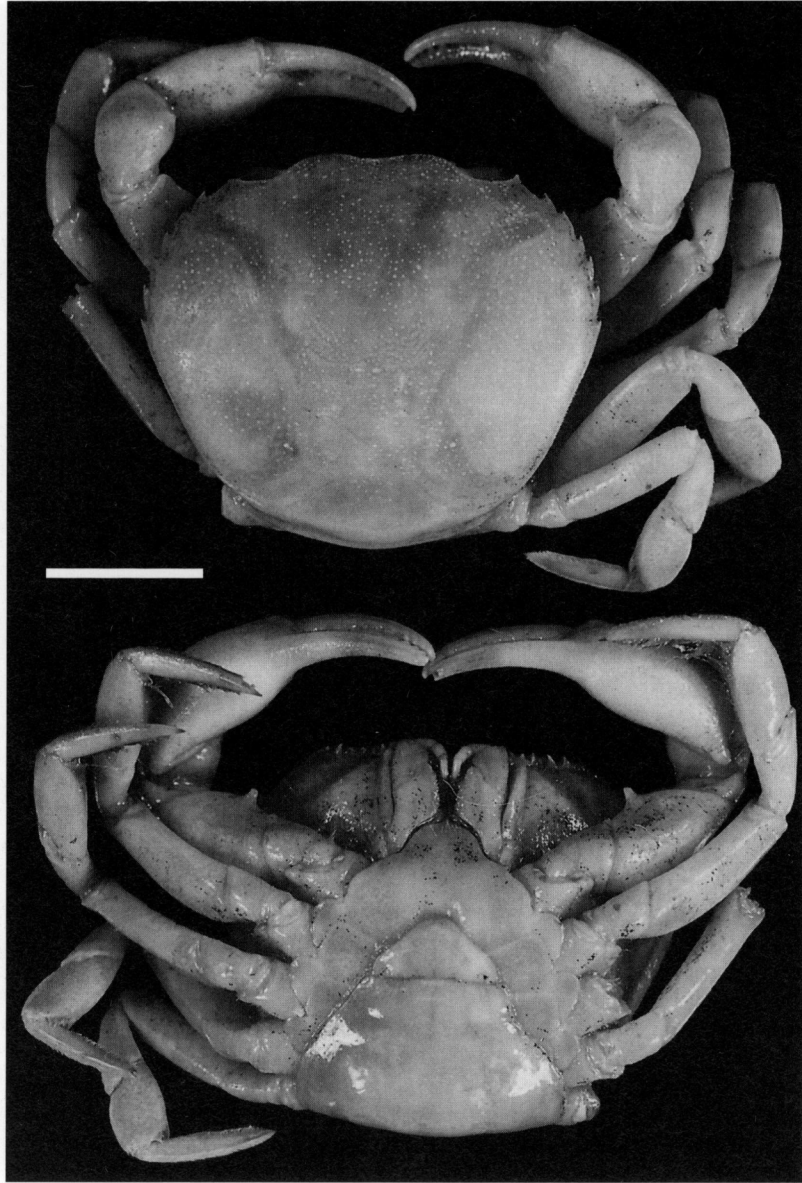
Fig. 25. Fredilocarcinus raddai (NHML 1883.26), dorsal and ventral aspect. — Scale 10 mm.