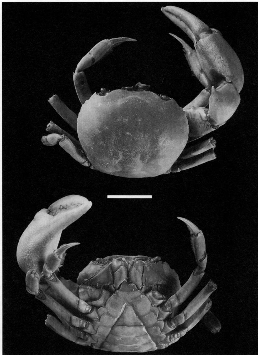
Fig. 27. Goyazana castelnaui (SMF 22263), dorsal and ventral aspect. — Scale 20 mm.