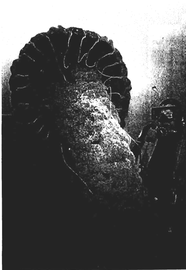
Figure 2. Chrysaora achlyos , new species, ventral view of different specimen photographed on same day and in same location as in Figure 1, with diver inspecting oral arms and underside of bell. Note number and arrangement of tentacles and spiraling and interlocking of oral arms.

1–3, table 1.—Anderson, 1992: 26 (four photographs by H. Hall).—Campbell, 1992: 2, 16, and inside front cover (all photographs by H. Hall).