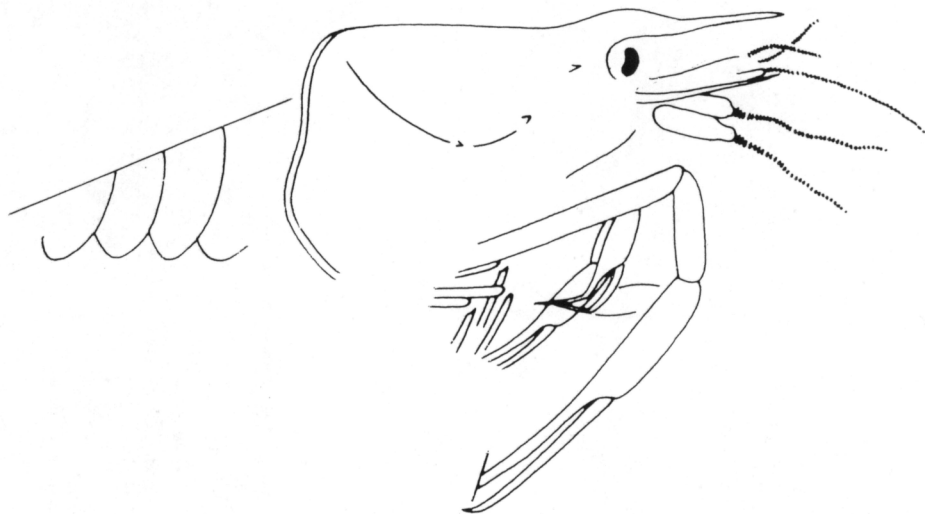
Fig. 13 — Ifasya straeleni n.sp., n.cat. MSNM i11141a, photo and reconstruction ( \times 3 ).