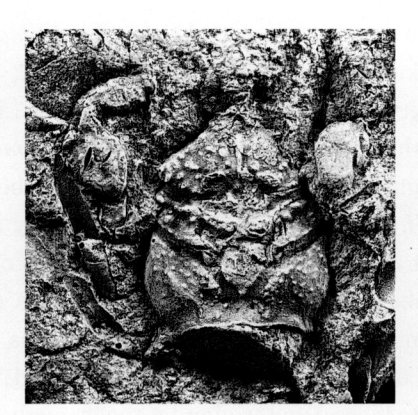
Fig. 8. Palehomola. P. richardsoni (Woodward), holotype, GSMC,×1.5, middle Cretaceous, Queen Charlote Island, British Colombia.