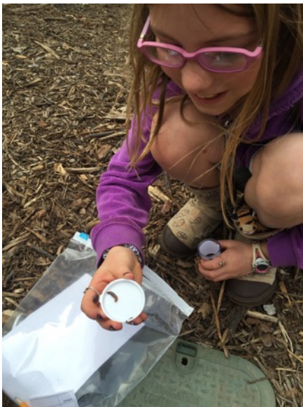
Participant in the Nature Garden Mollusk and Fungi collecting and observation event with a specimen of the slug Lehmannia valentiana .