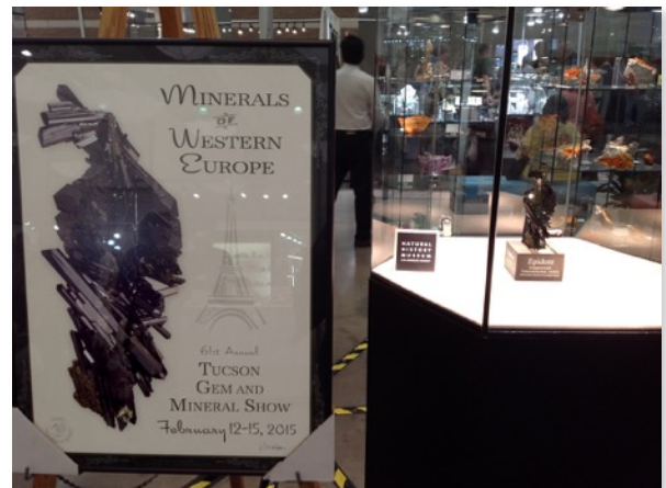
NHM's epidote from Knappenwand, Austria was featured on the Tucson Gem and Mineral Society Show posters.