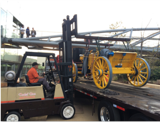
The dump wagon getting rigged onto a truck for transport to History's Carson Collection Facility.