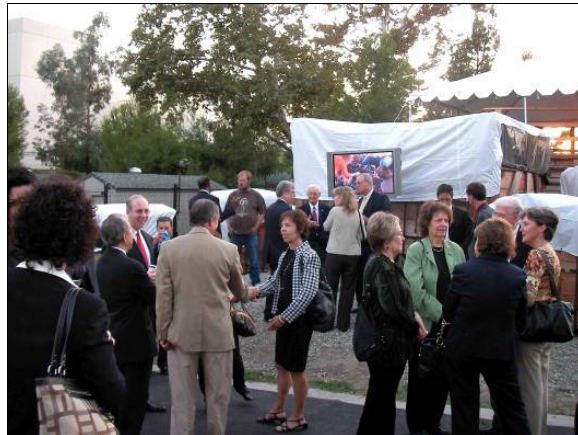
Above Trustees witnessed real-time excavation via a large monitor